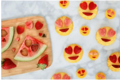
Heart-eye emoji fruit bites