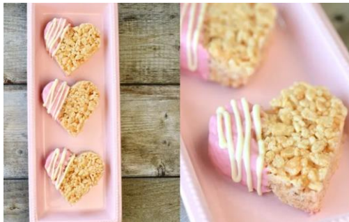
Heart-shaped rice Krispy treats