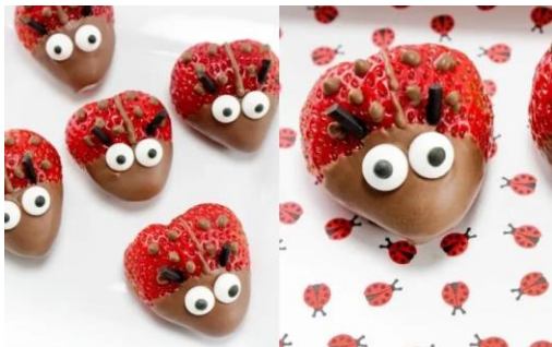
Ladybug Chocolate-covered strawberries