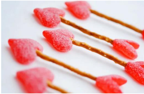
Cupid's Arrow Pretzels

Upon guests' arrival, snacks will be available for children and adults to munch on before the main meal is served. These festive, Valentine snacks will include both candies and healthy fruit options. These snacks are displayed below: