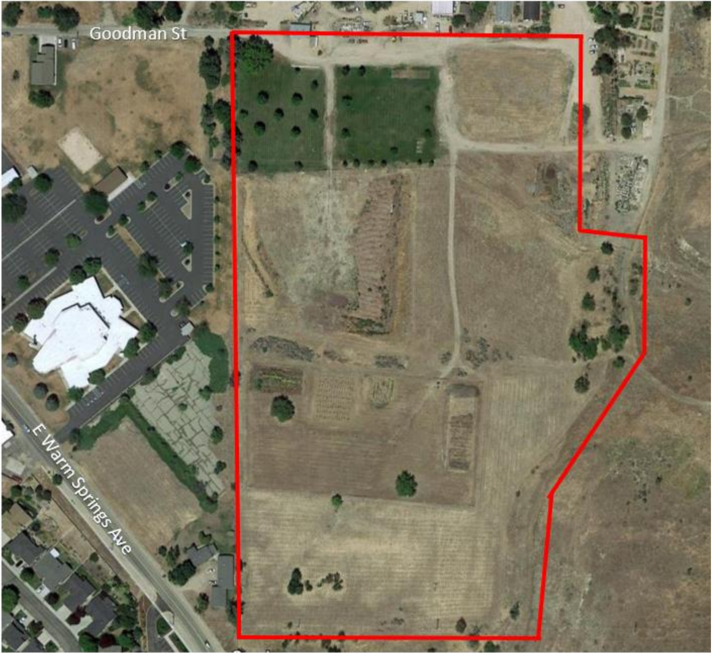
CWI Horticulture = HORT